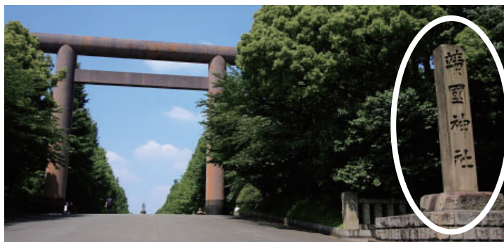
Shrine rank sign at the near side of the 1st Shrine Gate (Meeting point)